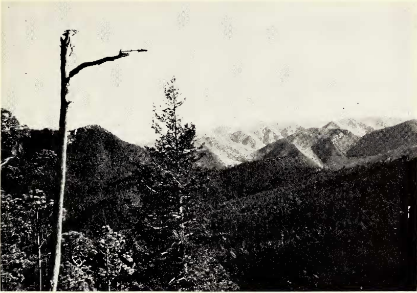
FIG. 2. Vicinity of La Encantada, illustrating the type and extent of the virgin forests in this area. A true fir ( Abies ) is in foreground.